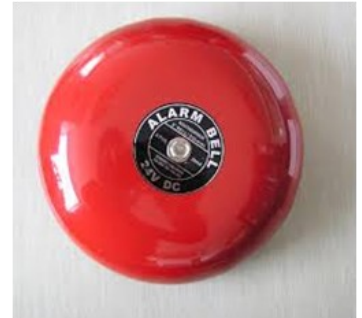
If there is a real emergency, come to St. Joseph's College. Map is posted in class entry.

"After you children change into their indoor shoes, take them to the bathroom so they can have 'a try.'"