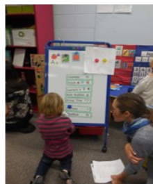
Your children will be your JK guide!

your children. At JK we believe we all have gifts to share and areas to work on. As you've likely figured out, the area I (Ann) need to work on is staying organized! I have much to learn from Jenn!