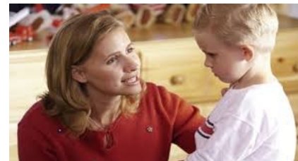
How to Give Clear Directions

Make sure you have your child's attention. Eye contact is a great indicator! When you count to five, you give her the opportunity to hear and process the direction. Parents often repeat the same direction over and over in that five second period; this teaches your child that she does not have to follow the direction the first time.