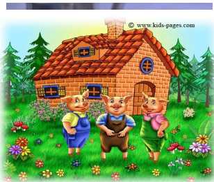
The important thing about

During October we focused on exploring the story “The Three Little Pigs,” began our art inquiry, and enjoyed a Dress up Pumpkin Party.