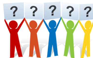
We're sharing art wonderings & questions.

The third stage involves reflecting on the process, and sharing it with others. This will happen at the Celebration of Learning! Patti Pente, our guest artists, will also return to JK as our inquiry wraps up. We are still looking for art experts!