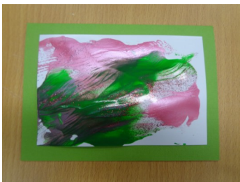
Hope you LOVED your “top secret” gifts!!

“Encourage question asking by saying, “Wow, that’s a good question!””