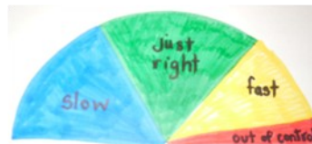
The a speedometer visual shows how our bodies can feel .

We will continue encouraging the children to learn more about their classmates while sharing space, toys, and companionship. Play sounds so simple, but it is so complicated !