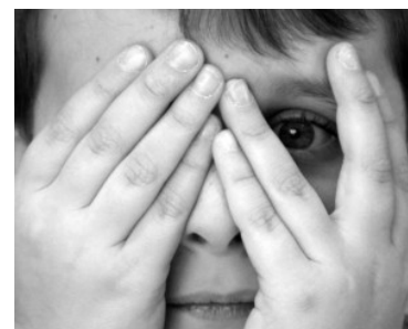
notice and name feelings

Read handout to find how a strong emotional vocabulary positively impacts children.