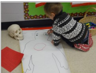
I can represent parts of my body on paper.

I can identify different parts of the body.