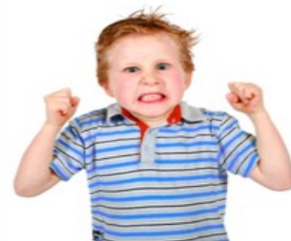
“He looks mad: he is making fists with his hands & he looks frustrated. I wonder why?”